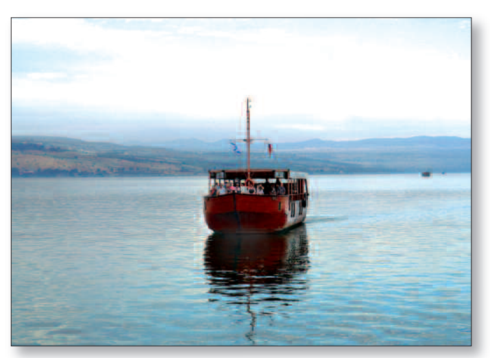
Boat Ride and Fellowship on the Sea of Galilee