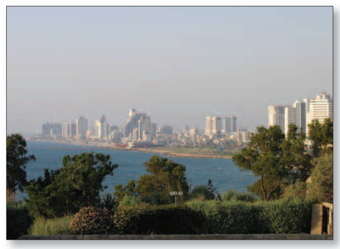
Tel Aviv, from the ancient port of Jaffa

"I will make you into a great nation and I will bless you; I will make your name great and you will be a blessing. I will bless those who bless you, and whoever curses you I will curse; and all peoples on earth will be blessed through you. (Genesis 12:2-3)