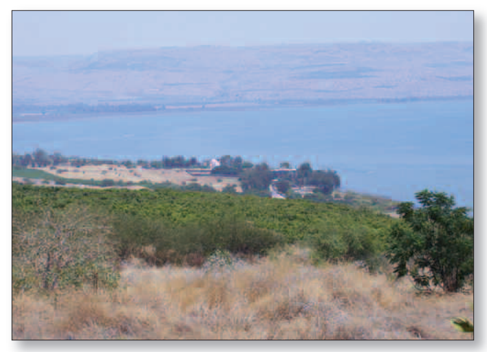
Sea of Galilee, viewed from the Mount of Beatitudes